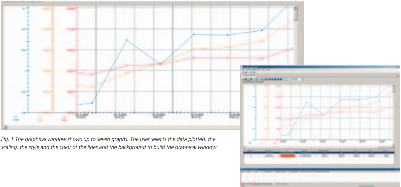
Fig. 1 The graphical window shows up to seven graphs. The user selects the data plotted, the scaling, the style and the color of the lines and the background to build the graphical window